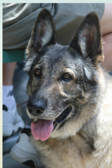
ELLIE MAE 11 YEARS YOUNG