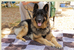
NOAH 6 YEARS YOUNG