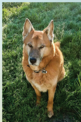
LEO 7 YEARS YOUNG