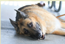
CARSON 10 YEARS YOUNG